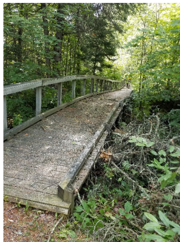
Before and after clearing the trails at the Oconto Barrier Free Fishing Area on the Chequamegon-Nicolet National Forest.